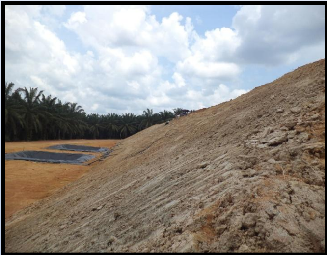
Completed sludge collection pond.