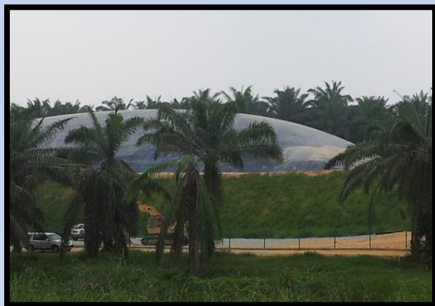
Completed cover with captured gas.