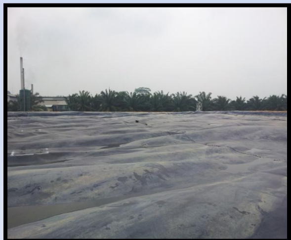
Completed cover before captured gas.