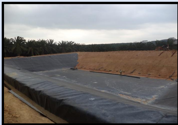
Base and slopes lined with 1.5mm thk. HDPE Liner.