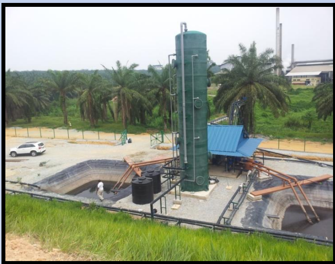
Gas pretreatment system.