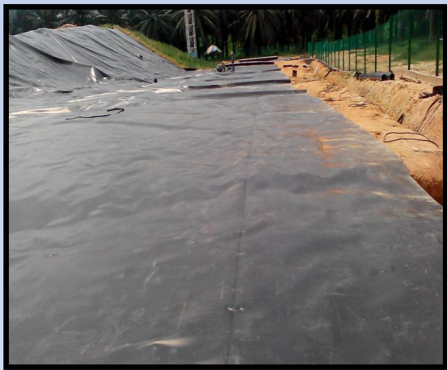
Deployment of HDPE liner for Cover.