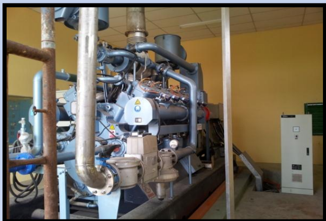
Gas Engine assembly inside gas engine room.