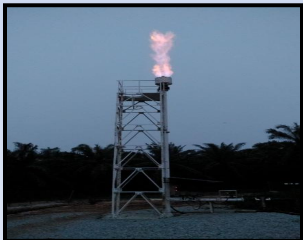
Open Flare system assembly beside AD pond.