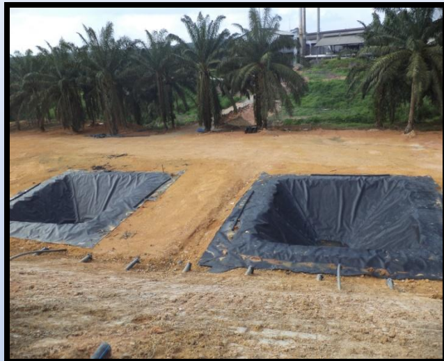
Completed sludge collection pond.