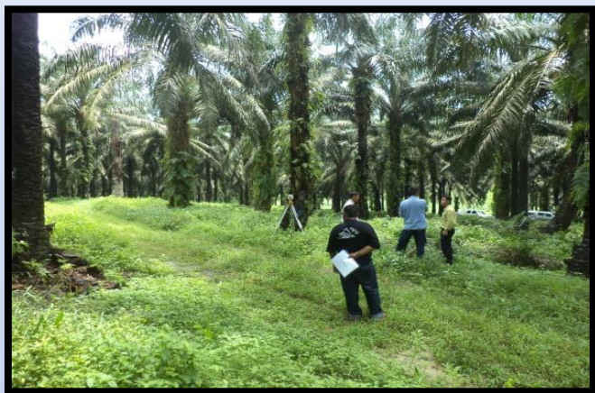
Site survey before construction.